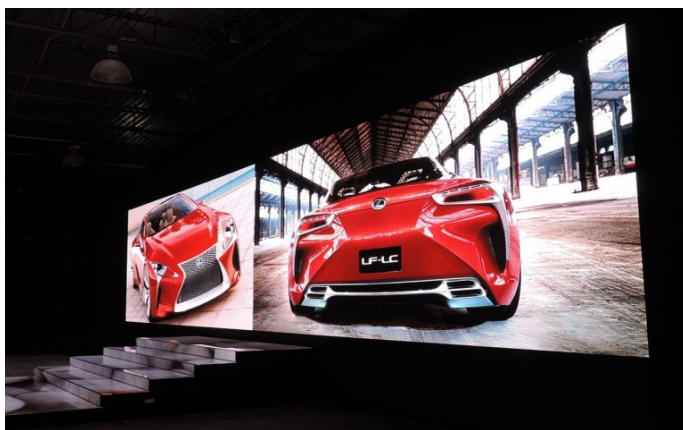
TOKYO MOTOR SHOW 2017 DAIHATSU BOOTH